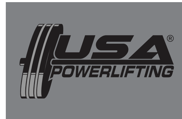
■ On Other Colors (Black Option)