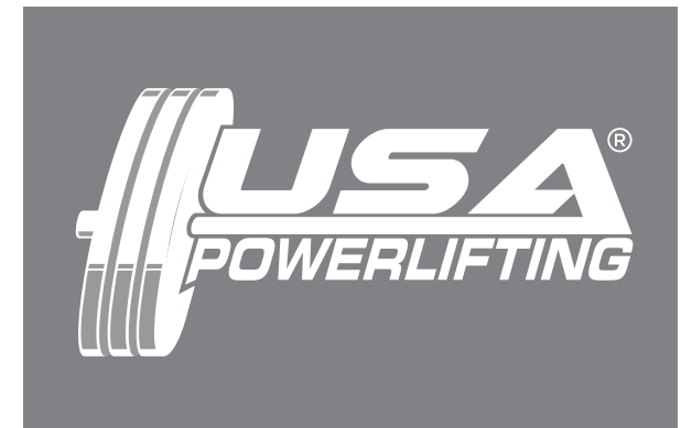
■ On Other Colors (White Option)