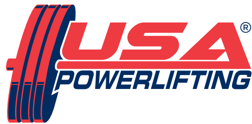
■ On White Backer