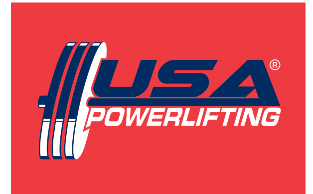
■ On Red Backer