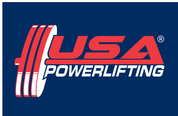
■ On Blue Backer