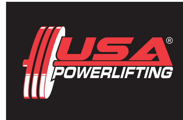
■ On Black Backer